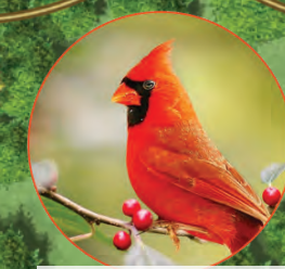
Northern Cardinal (Cardinalis cardinalis)