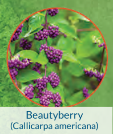
Beautyberry (Callicarpa americana)

7 Lakeside Park • Fishing Pier & Community Dock • Lake Fully-Stocked with Channel Catfish, Largemouth Bass, Hybrid Striped Bass, Bream & Grass Carp • Kayak & Canoe Racks • Picnic Area • Lake Beach