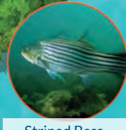
Striped Bass (Morone saxatilis)