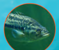
Largemouth Bass (Micropterus salmoides)