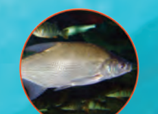
Bream (Abramis brama)