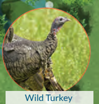
Wild Turkey (Meleagris gallopavo)