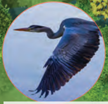
Great Blue Heron (Ardea herodias)