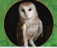
Barn Owl (Tyto alba)