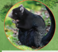
Fox Squirrel (Sciurus niger)