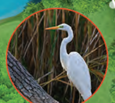
Great Egret (Ardea alba)