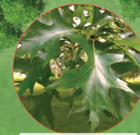
Pin Oak (Quercus palustris)